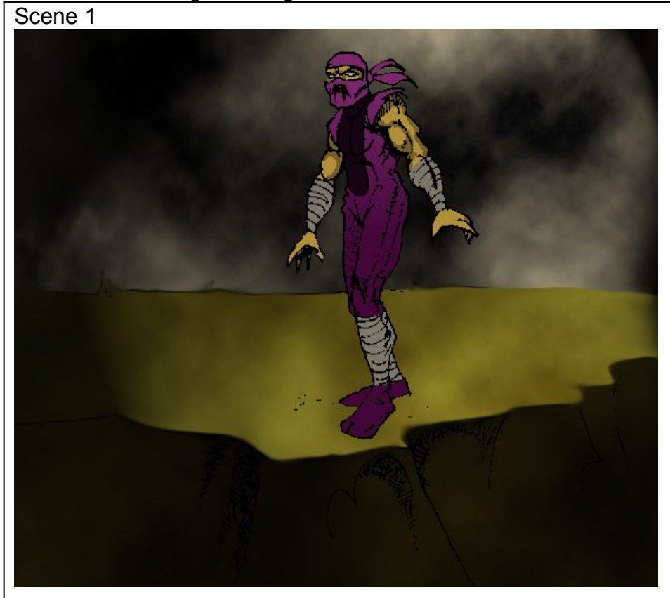
Scene 2.2 Meeting the Dragon